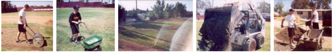
Players take pride in working together to take care of their playing fields